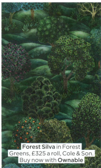
Forest Silva in Forest Greens, £325 a roll, Cole & Son. Buy now with Ownable

Liven up your walls with these bursting-with-pattern designs