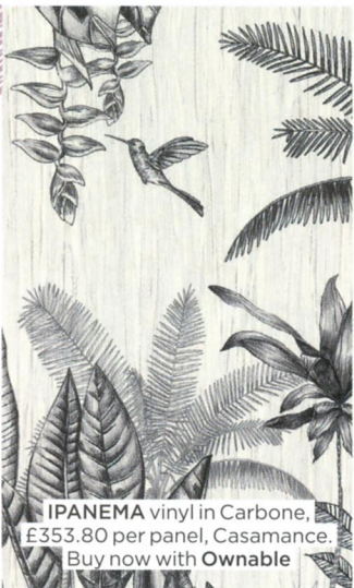
IPANEMA vinyl in Carbone, £353.80 per panel, Casamance. Buy now with Ownable