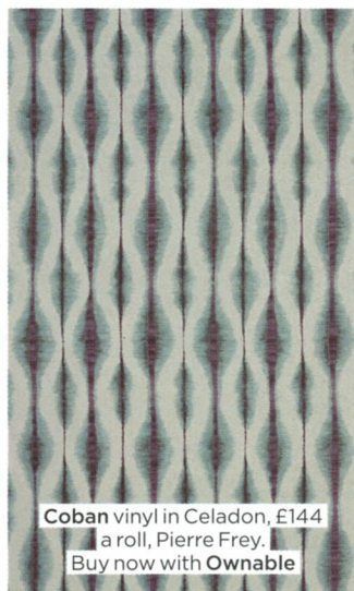
Coban vinyl in Celadon, £144 a roll, Pierre Frey. Buy now with Ownable