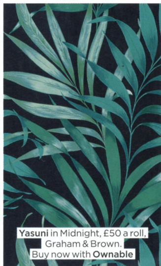
Yasuni in Midnight, £50 a roll, Graham & Brown. Buy now with Ownable