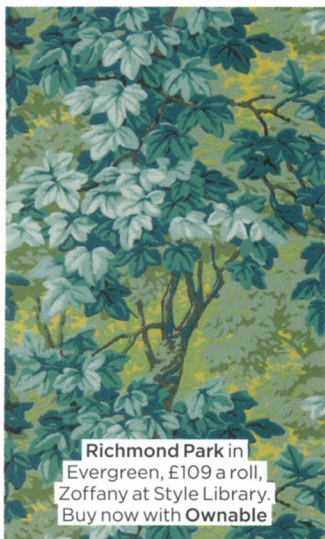
Richmond Park in Evergreen, £109 a roll, Zoffany at Style Library. Buy now with Ownable