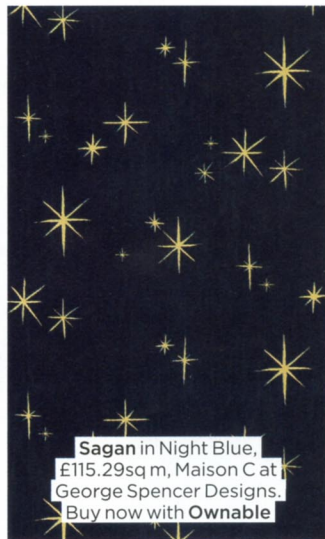
Sagan in Night Blue, £115.29sq m, Maison C at George Spencer Designs. Buy now with Ownable