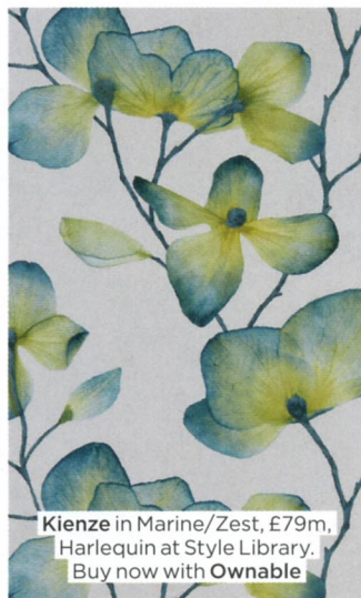
Kienze in Marine/Zest, £79m, Harlequin at Style Library. Buy now with Ownable